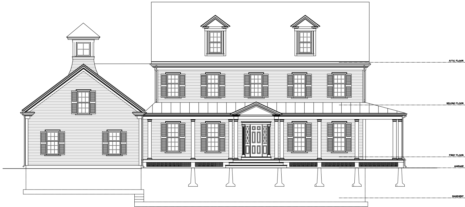
1 FRONT (SOUTH) ELEVATION SCALE 1/4" = 1'-0"

A:\Projects\2020\2020-07-27-147814-101-102-Drawing\Drawing\Notes - 07-27-2020.rvt Author: B. Erickson Date: 07-27-2020 10:30 AM