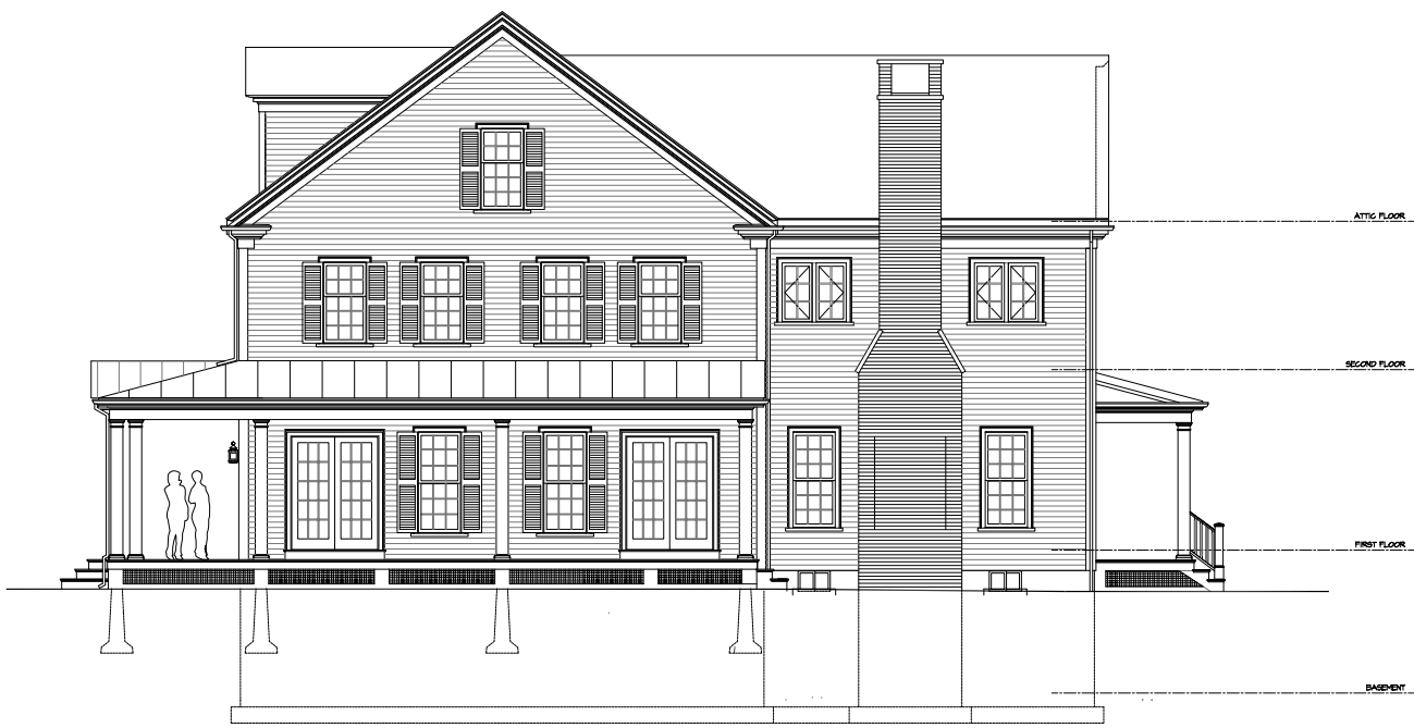
1 RIGHT SIDE (EAST) ELEVATION SCALE 1/4"=1'-0"

4/10/2020 10:00 AM C:\Users\frank\OneDrive\Documents\Projects\2020\11-04-2020\11-04-2020.dwg